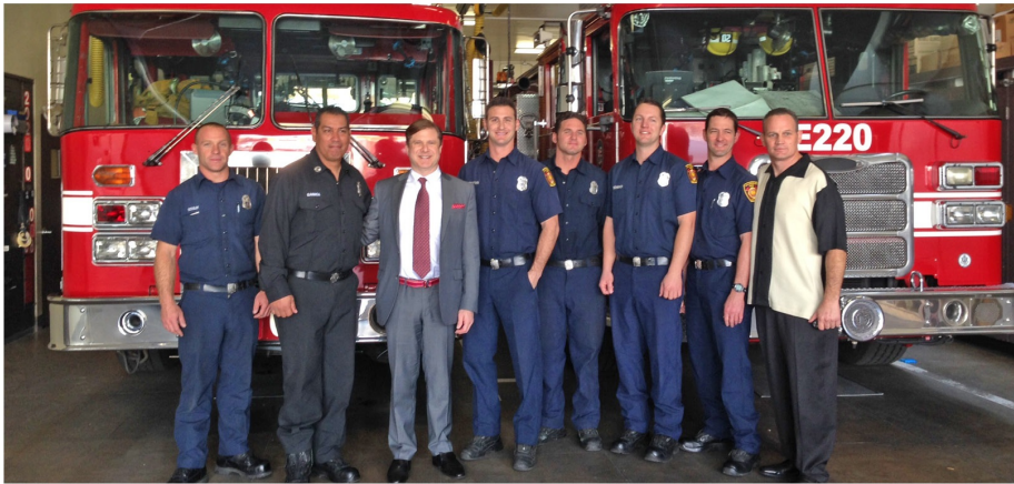
With some of LA's best at Fire Station 20 in Echo Park.